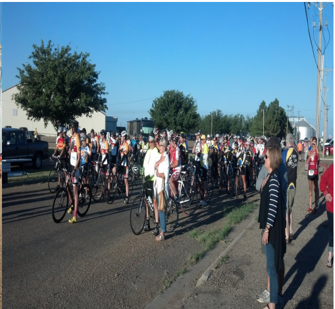
All pledging allegiance