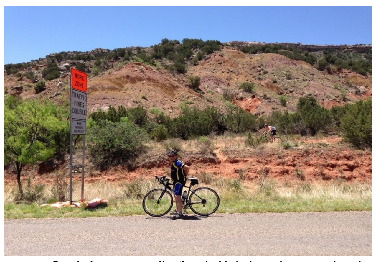
Ross had to stop—speeding fines double in the work zone, you know!