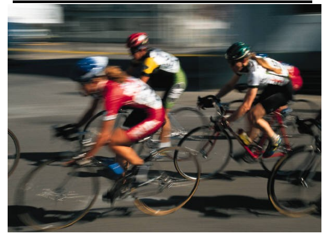
2013 RIDING CHALLENGE